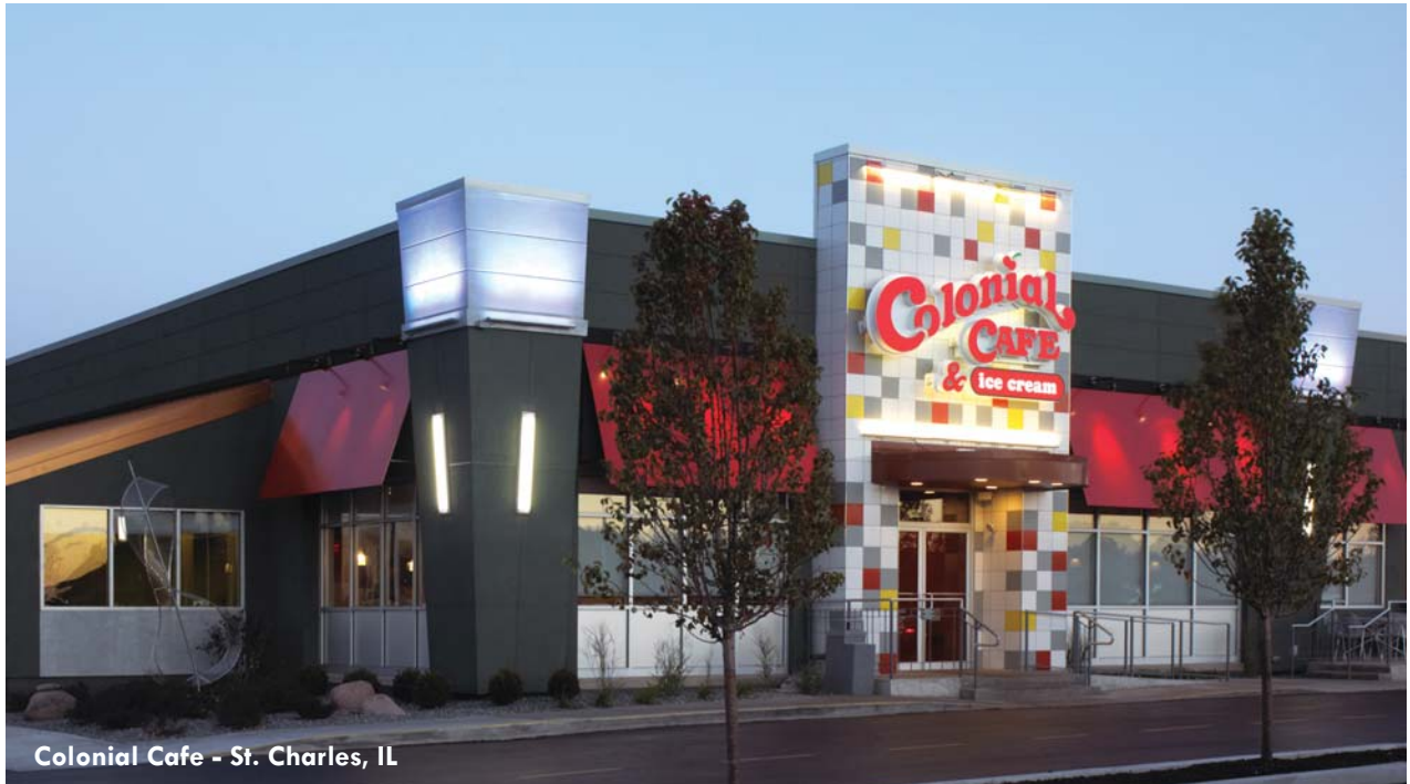
Colonial Cafe - St. Charles, IL

2009 AIA Northern Illinois Chapter Outstanding Firm of the Year