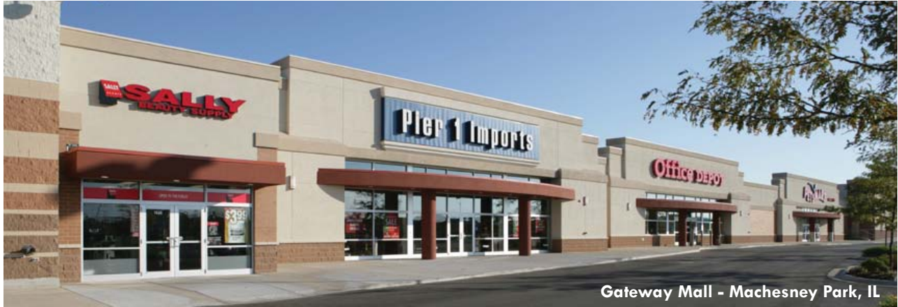
Gateway Mall - Machesney Park, IL