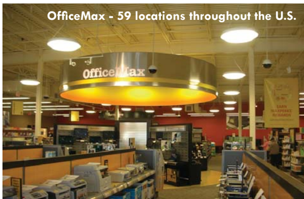
OfficeMax - 59 locations throughout the U.S.