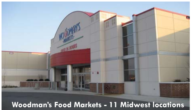
Woodman's Food Markets - 11 Midwest locations